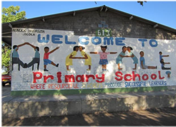
Okatale Primary School in Northern Namibia