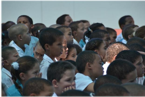
Children of the Rehoboth Primary School at the Celebration of Independence Day 2013

After visiting the Namib Primary School in Swakopmund in 2008, Arthur Rohlfing decided to find a way to support vulnerable school children in order to give them a chance to receive basic education. With a very high unemployment rate and a low average monthly income of about 120 Euro, many parents cannot afford to pay the school-related costs for their children. Although primary education is free, parents must pay fees for uniforms, books, hostels, and school improvements. Education is however a key for a liveable future and also for the development of Namibia. For these reasons, Mr Rohlfing and nine other people founded the non-profit organization Sonnenkinderprojekt in Schwaförden, Germany in the same year.